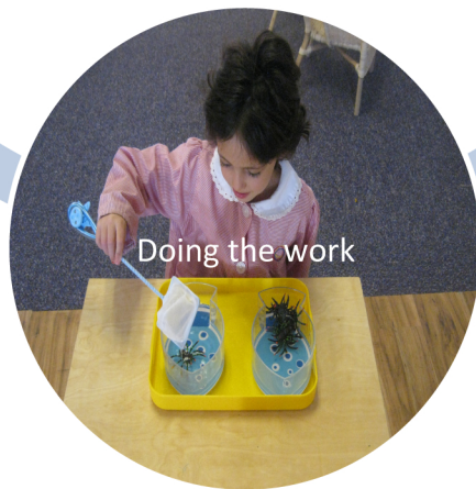
Doing the work