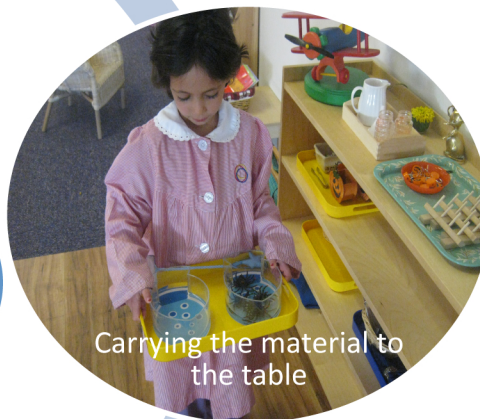
Carrying the material to the table