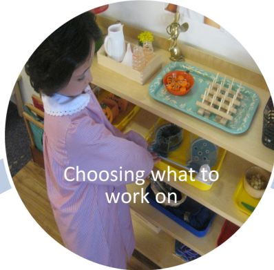
Choosing what to work on