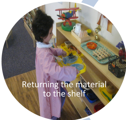
Returning the material to the shelf